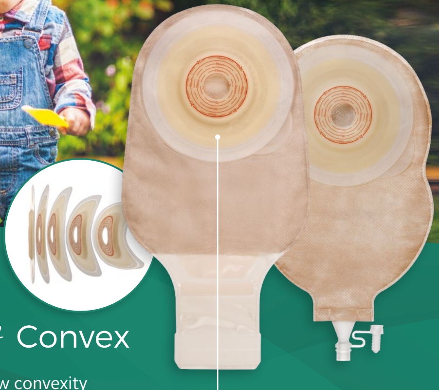
Soft Convex Wafer Depth = 4mm (1/8")

Provide Options for More Comfort and Flexibility